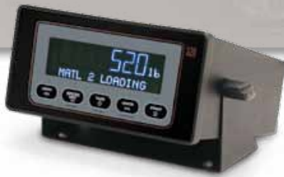
The 520 guides operators through weighing processes with a 16-character prompting display that can be programmed with up to eight different messages. Desktop model shown.

The 520—delivering process control solutions for today... and beyond.