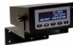
Desktop Wall Mount

Your Rice Lake Weighing Systems distributor is: